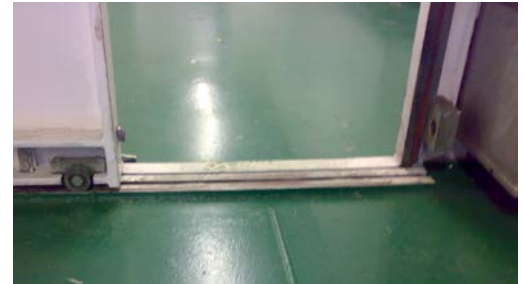
Option: Low sill

Limited to 8,5 mWc (i.e. test pressure) at size 2100x1400 mm